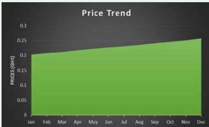
Fig. 1 Price Trend Analysis

The fund has surpassed its 2013 spectacular performance and recorded a gain of 30% at a price of GH¢0.26 as against GH¢0.20 as at the end of 2013; returns of 26.6% in 2013. The price trend of the fund for the year under review is shown below: