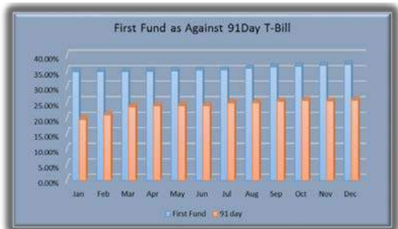
Fig. 3 First Fund against 91day T-Bill

The Fund as against its major benchmarks.