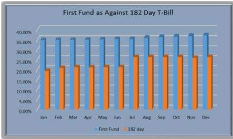
Fig. 4 First Fund against 182 day T-Bill